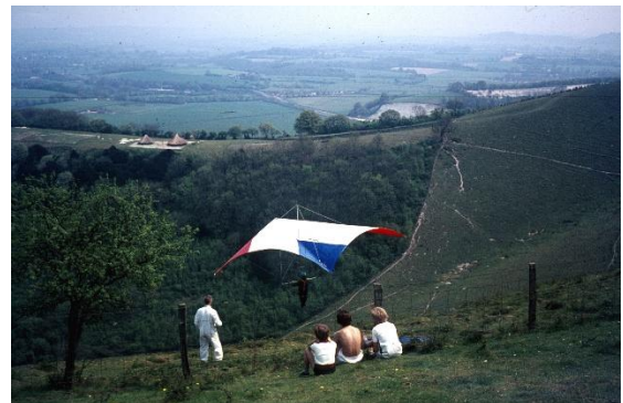
That's me on the right watching the hang glider, with the original Farm in the distance . Photo c.1974