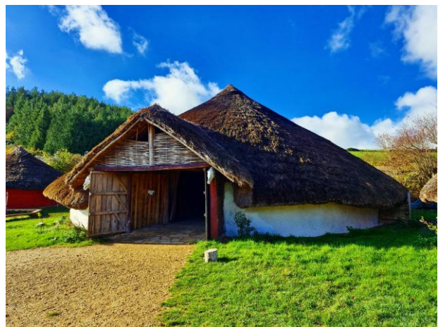
The villa and roundhouse photos 2025.