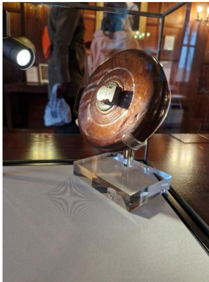
Basil Brown's Tape Measure