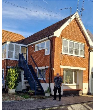
When in Framlingham...